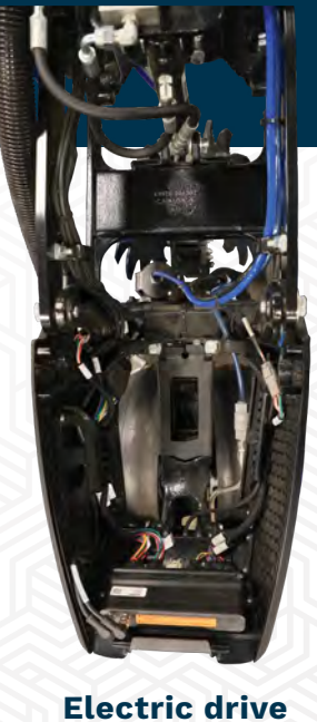
system harness integrated harness routing and retention protects the electric drive system